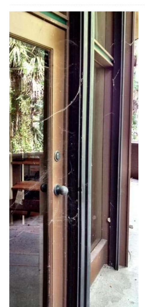
The 40-year-old College of Life building is for sale, as is the surrounding 88 acres.