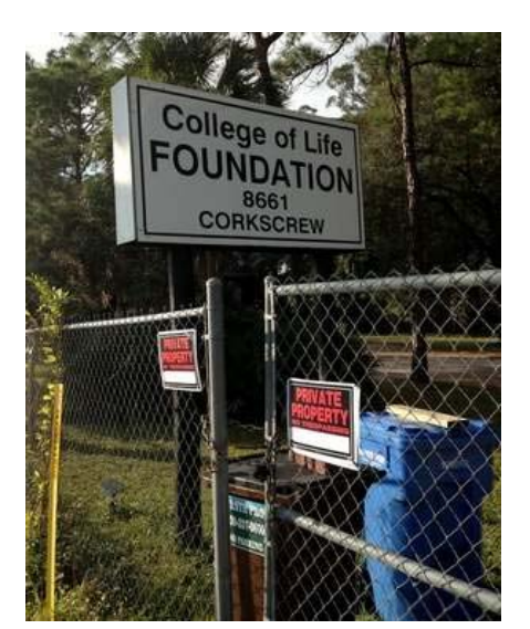
Because its board members travel often, the College of Life Foundation is often locked up.