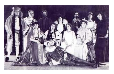
The Koreshans put on a variety of productions ranging from musical comedies to Shakespeare.